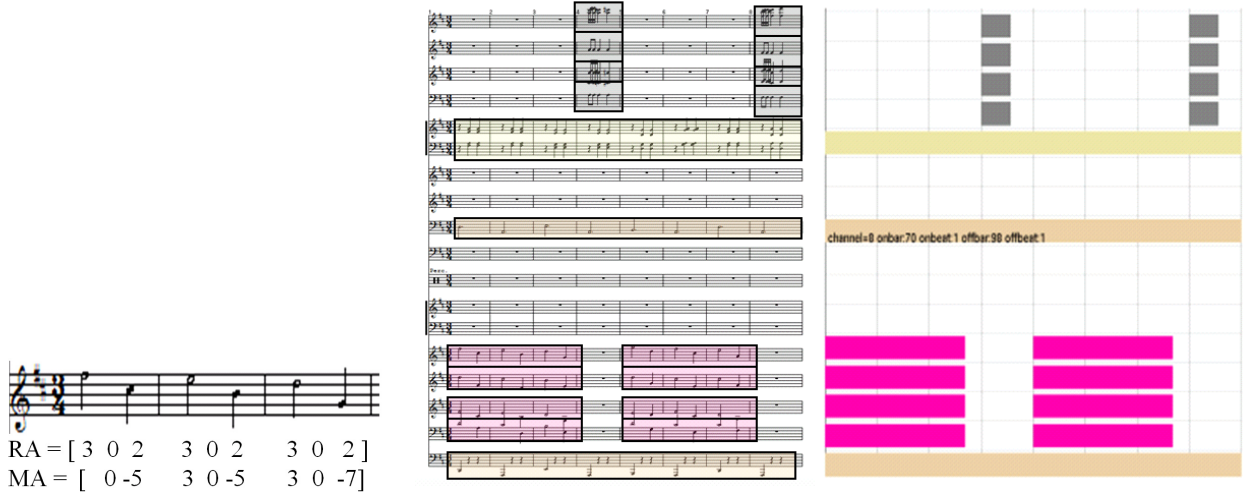
Figure 1. (Left) RA and MA vectors. (Center) Result of note-block generation and role determination. Pink blocks denote the main melody, yellow and flesh blocks denote accompaniments, and gray blocks denote decorations. (Right) Visualization by Colorscore.

to the pattern. Then, Colorscore applies the same process to the remaining note-blocks.